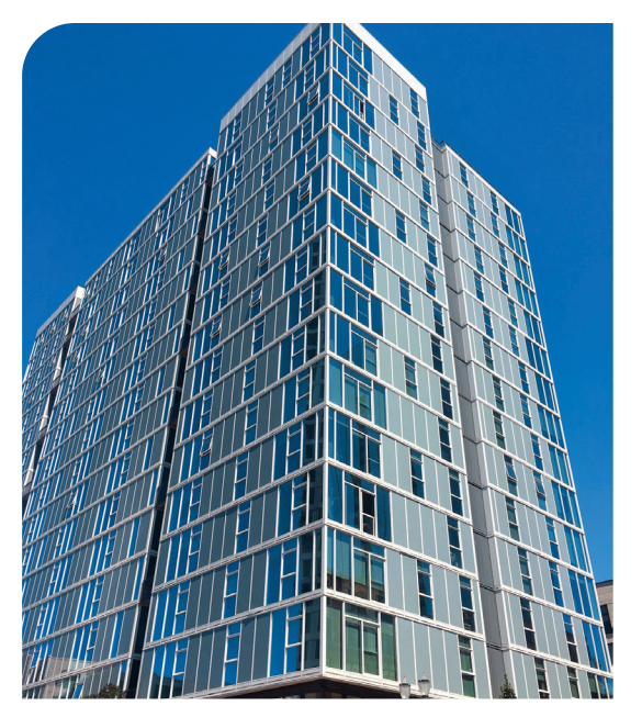
Hoyt Street Yards No. 2 | Portland, Oregon - USA | Architect: Bora Vitro Certified™ Fabricator: Vitrum Industries Ltd.

Solarban<sup>®</sup> Acuity<sup>™</sup> glass also is ideal for distinctive exterior applications, such as atriums, skylights and spandrel glass.