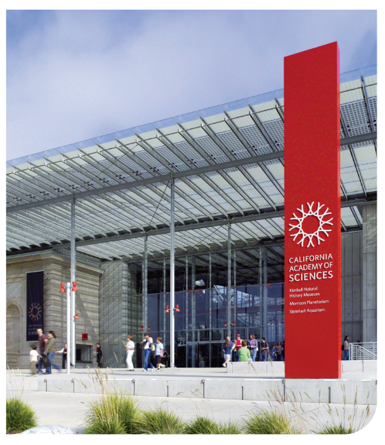
California Academy of Sciences | San Francisco, California - USA Architects: Renzo Piano Building Workshop and Stantec Architecture